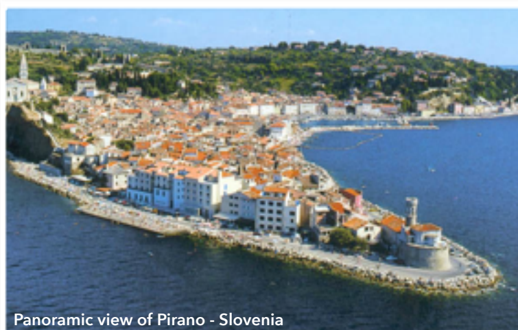
Panoramic view of Pirano - Slovenia