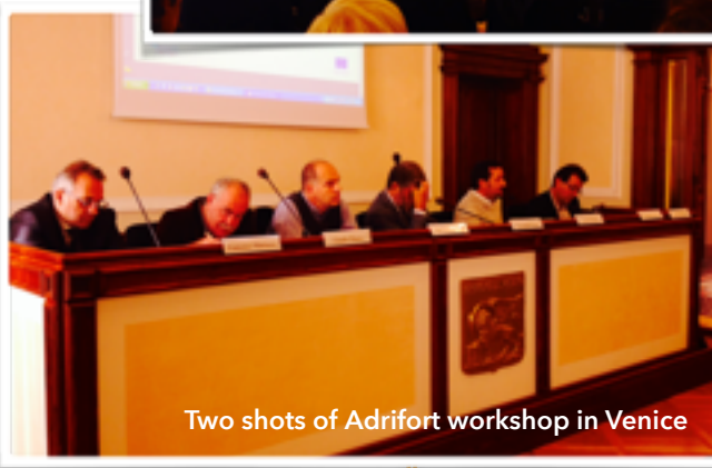
Two shots of Adrifort workshop in Venice