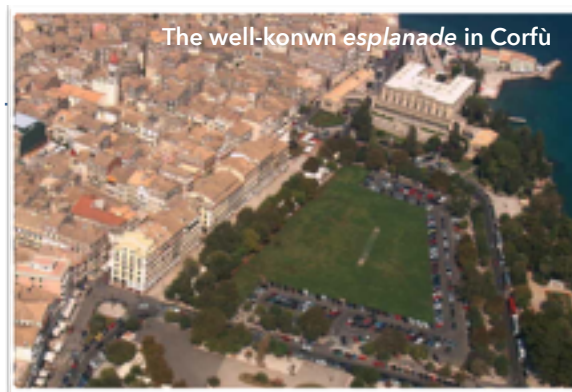
The well-known esplanade in Corfu

The City holds the typical shape of fortified Mediterranean harbour. In 2007, the old town of Corfu was inscribed to the UNESCO World Heritage List. Adrifort project involves Gouvia Venetian Naval Base and its surrounding area, located ten km North-East from the City of Corfu. Today, the site keeps the special characteristics of the original military architecture without overlooking the aesthetic value of the construction.