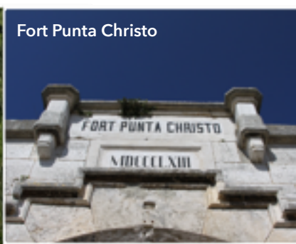
Fort Punta Christo